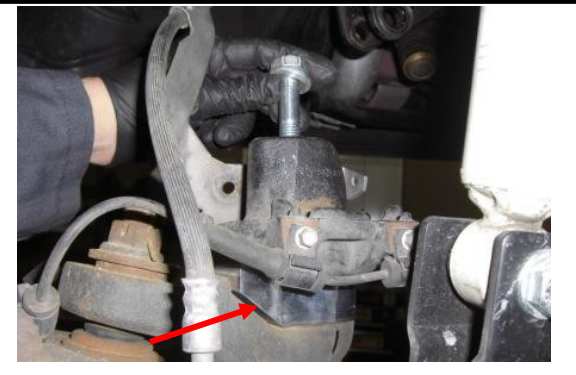
Install the supplied M14 x 90mm bolt and washer through the OEM spring perch and 1.5" spacer. Tighten to 136lb-ft.