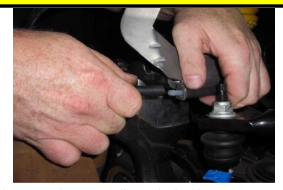
Disconnect the vacuum line at the bracket

Please read instructions thoroughly and completely before beginning installation. Check www.Readylift.com for any installation instruction updates Installation by a trained mechanic is recommended.