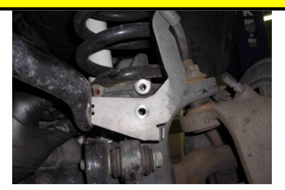
Remove the lower vacuum and brake line support bracket bolt .

Please read instructions thoroughly and completely before beginning installation. Check www.Readylift.com for any installation instruction updates Installation by a trained mechanic is recommended.