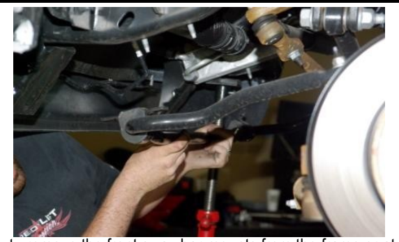
Next, remove the front sway bar mounts from the frame or at the end links, (not shown), and lower. Then lift vehicle off ground and support on frame with jack stands.