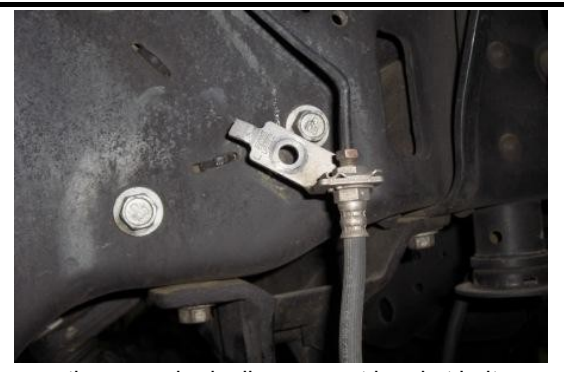
Remove the upper brake line support bracket bolt.