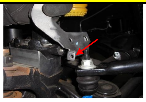
Please notice the orientation of the tab that the vacuum line goes through.