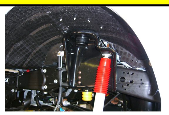
Carefully lower the front axle enough to remove the coil spring.