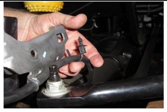
Carefully remove the zip tie clip from the lower brake line bracket.