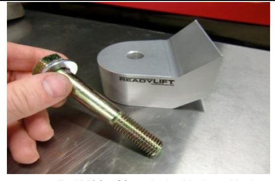
Prepare supplied M14 x 90mm bolt with thread lock compound and place T6-2111 billet spacer between lower spring perch and steering knuckle.