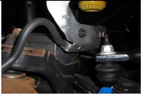
Reconnect the vacuum line and zip tie clip. Reinstall bracket onto lower spring perch and check clearances.

Repeat these step on opposite side of vehicle. Install the factory coil and rubber isolator. Make sure that the bottom of the coil is properly seated in the spring perch, (proper spring clocking). Raise the axle so that you can reinstall lower shock bolt. Install the upper and lower brake line support bracket bolts. Reinstall the front sway bar at the frame rail. Install wheels/tires and lower vehicle onto ground. Raise track bar into track bar bracket, install factory nut and bolt. Tighten to 406 lb-ft of torque. Tighten all hardware to factory torque specs.