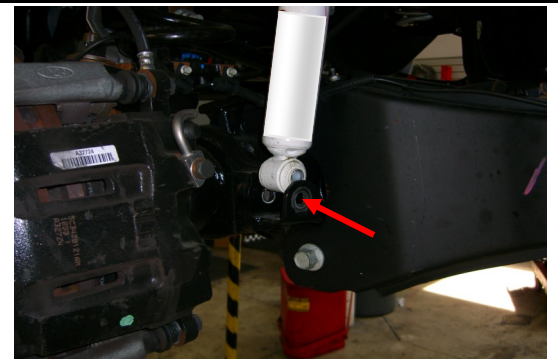
Remove the lower shock mounting bolt.