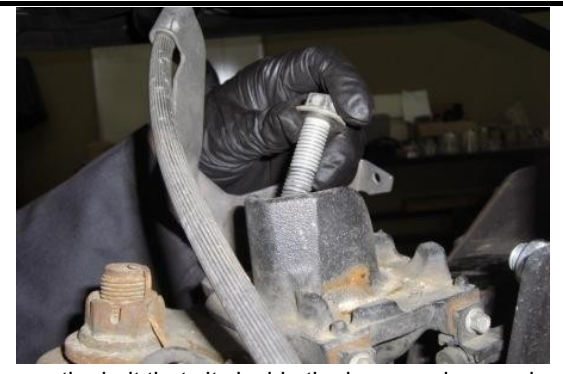
Remove the bolt that sits inside the lower spring perch. .