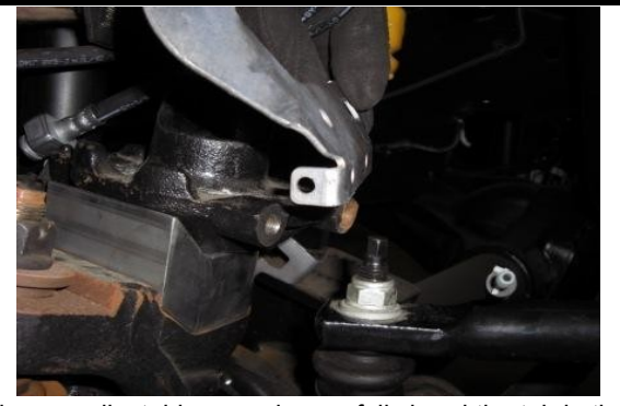
Using an adjustable wrench, carefully bend the tab in the opposite direction.