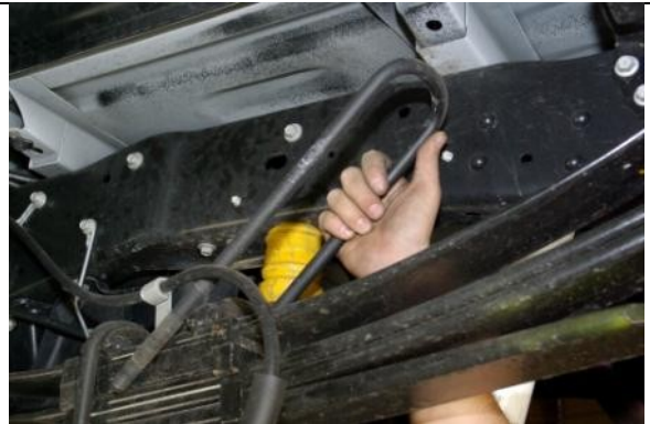
Remove U-bolts and slowly lower axle to remove OE block.