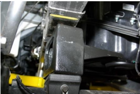
Lower axle enough to install taller block, align and raise axle