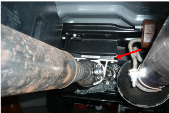
With vehicle on the ground install carrier bearing drop plate.

Note: Final torque of the new U-bolts should be done with the vehicle on the ground and to the proper specs. Make sure the u-bolts have the equal amount of threads visible on all (8). Take care to tighten the carrier drop plate centered and aligned on the cross-member. Recheck all work before and after test drive.