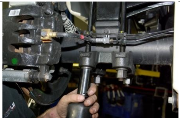
.Install longer U-bolts and nuts onto axle plate. Torque later.