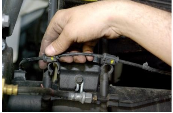
Vehicles with ABS/TC remove clips from U-bolts.