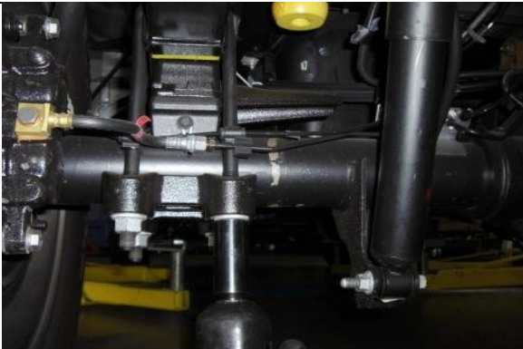
Remove U-bolt nuts and axle mounting plate.