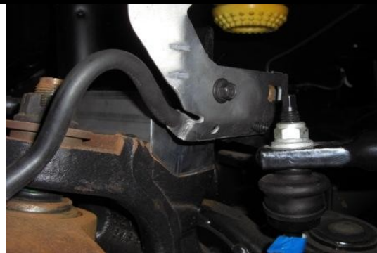
Reconnect the vacuum line and zip tie clip. Reinstall bracket onto lower spring perch and check clearances.

Repeat these step on opposite side of vehicle. Install the factory coil and rubber isolator. Make sure that the bottom of the coil is properly seated in the spring perch, (proper spring clocking). Raise the axle so that you can reinstall lower shock bolt. Install the upper and lower brake line support bracket bolts. Reinstall the front sway bar at the frame rail. Install wheels/tires and lower vehicle onto ground. Raise track bar into track bar bracket, install factory nut and bolt. Tighten to 406 lb-ft of torque. Tighten all hardware to factory torque specs.