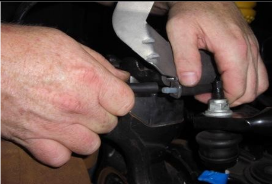
Disconnect the vacuum line at the bracket

Please read instructions thoroughly and completely before beginning installation. Check www.Readylift.com for any installation instruction updates Installation by a trained mechanic is recommended.