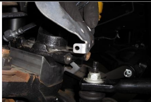
Using an adjustable wrench, carefully bend the tab in the opposite direction.