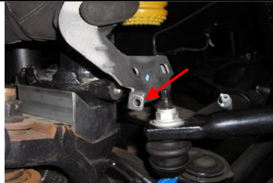
Please notice the orientation of the tab that the vacuum line goes through.