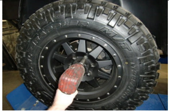
Reinstall wheels/tires and lower vehicle to ground