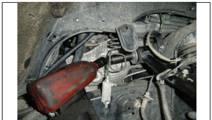
At the frame loosen & remove UCA pivot mounting hardware