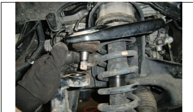
Disconnect upper ball joint and separate from UCA