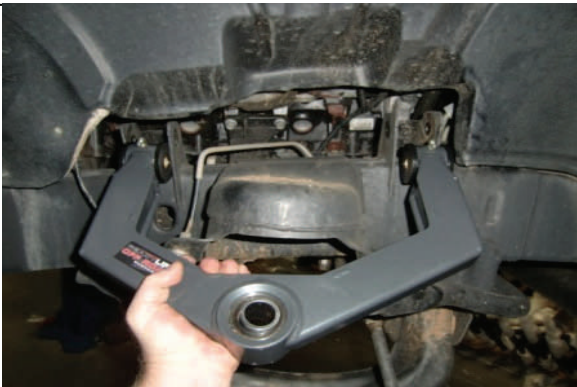
Install new UCA into frame and attach with OE hardware