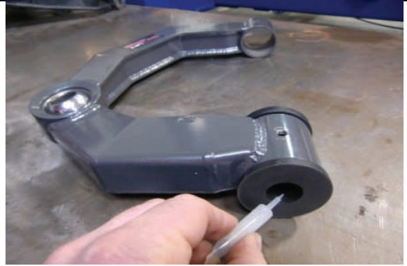
Apply lube to inside of pivot sleeve and insert pivot tube