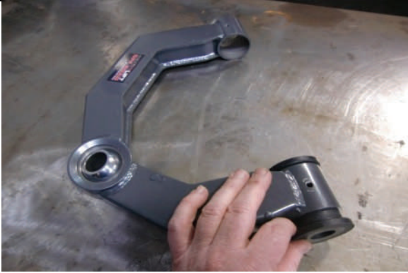
Install Urethane bushings into UCA, DO NOT use lube here.