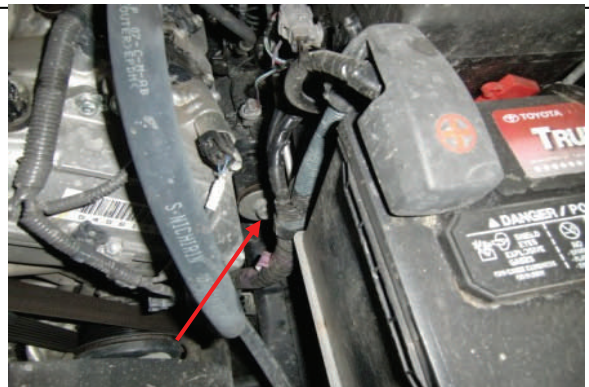
Photo shows UCA mounting bolt and battery proximity