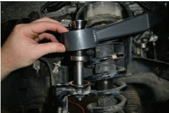
Slide UCA w/ misalign spacers onto tapered pin in spindle