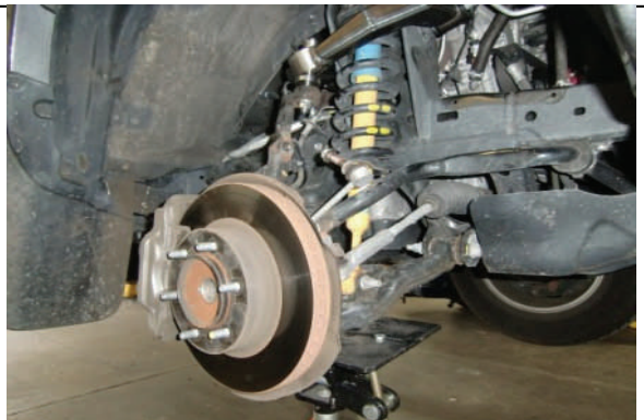
Raise suspension, if necessary, to attach UCA hardware