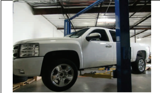
Securely lift front of vehicle and support frame