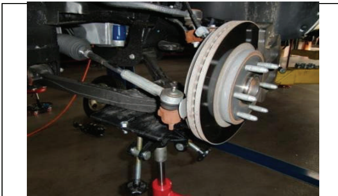
Support lower control arm with floor jack