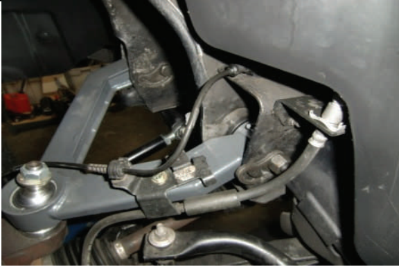
Reattach ABS wiring removed previously onto UCA