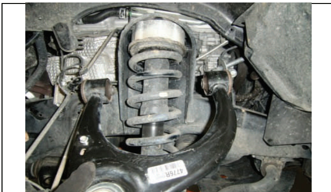
Remove UCA from frame