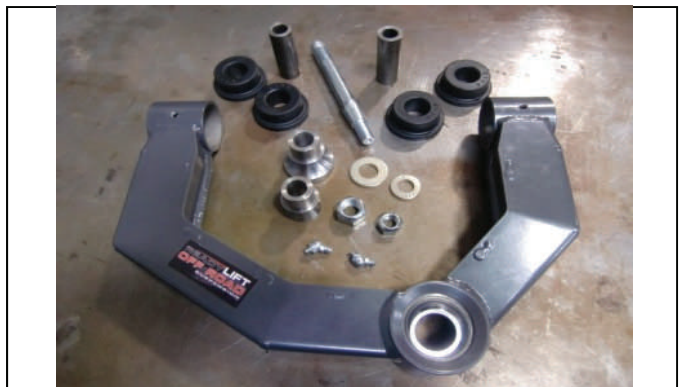
Assemble your new OFF-Road Series UCA with hardware kit