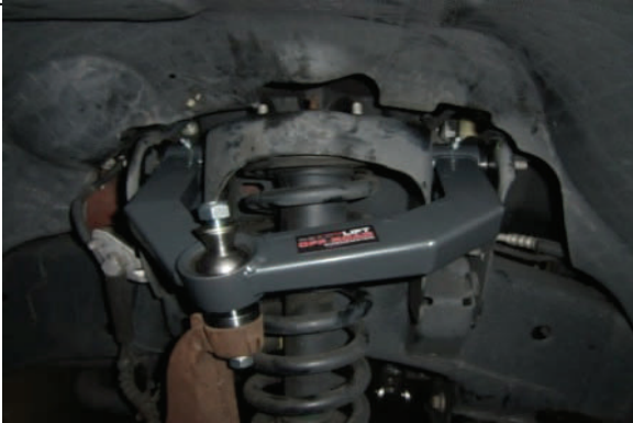
Example photo 2 (Dodge Ram 1500 UCA)