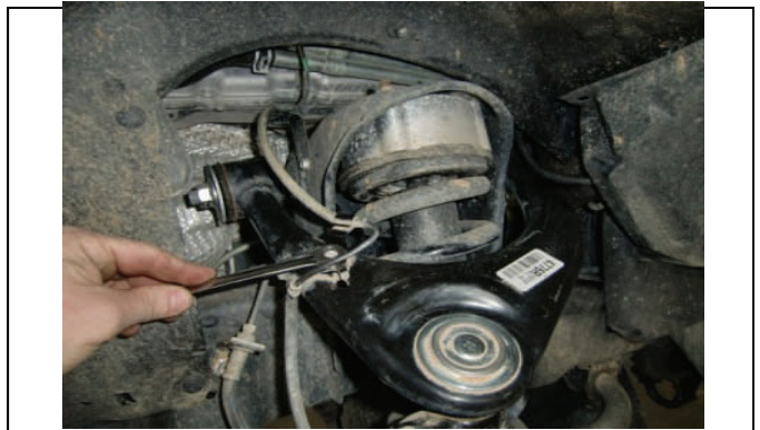
Disconnect any ABS wiring attached to UCAs