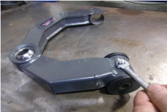
Install zerk fittings