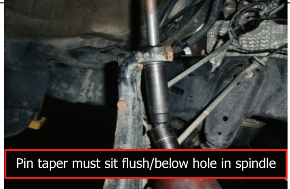
Insert machined tapered pin into spindle and tighten to spec