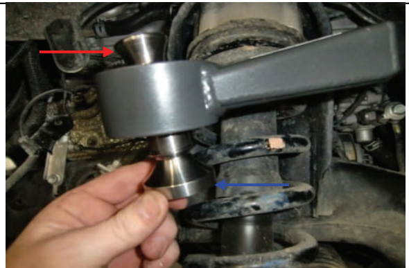
Place upper (sm)/lower (lg) misalignment spacers into uniball