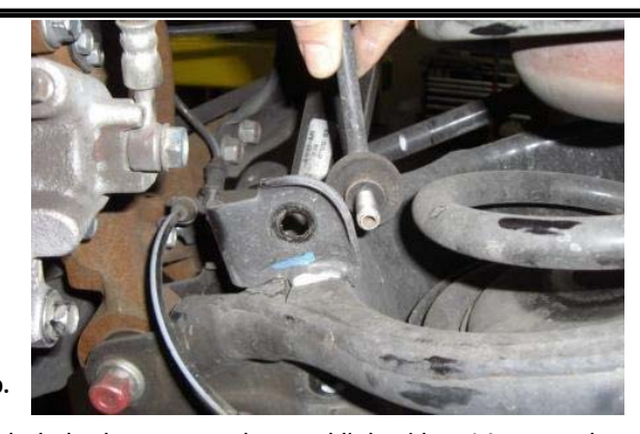
Unbolt the lower sway bar end link with a 14mm socket.