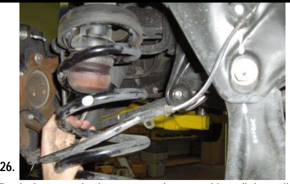
Push down on the lower control arm and install the coil. Make sure that the coil is properly seated in the lower control arm.