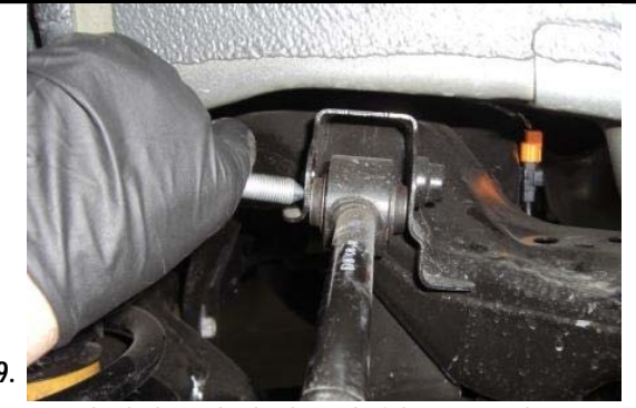
Remove the bolt on the body end of the arm and remove the stock arm. Make sure that both ends of the EZ Arm have equal thread showing on both sides of the turnbuckle.