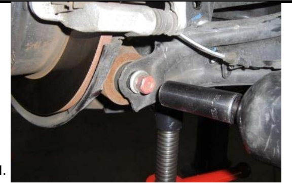
Remove the bolt that connects the lower control arm to the knuckle.