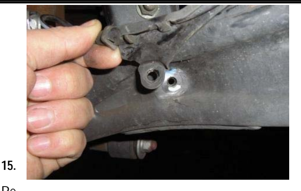
Remove the two 10mm bolts that hold the ABS line support

If vehicle is on jack stands, lower the vehicle to the ground. Chock the front wheels to prevent a rollout, 14. lift the rear of the vehicle by the frame and support with jack stands. Please consult your owners manual for the proper locations to support your vehicle.