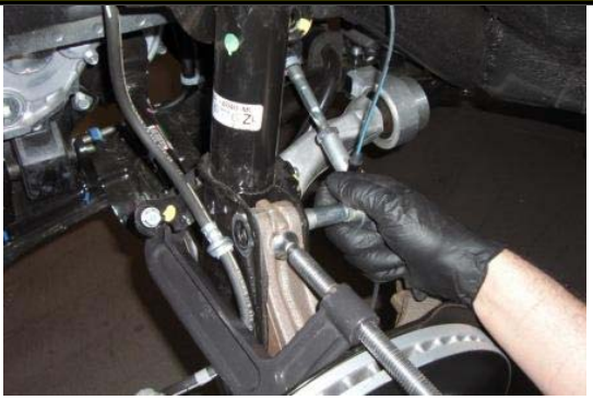
Insert the knuckle into the lower strut mount. A C-Clamp may be needed to align the mounting holes. Insert the OEM hardware and tighten to 200 lb-ft.

Please read instructions thoroughly and completely before beginning installation. Check www.Readylift.com for any installation instruction updates Installation by a trained mechanic is recommended.