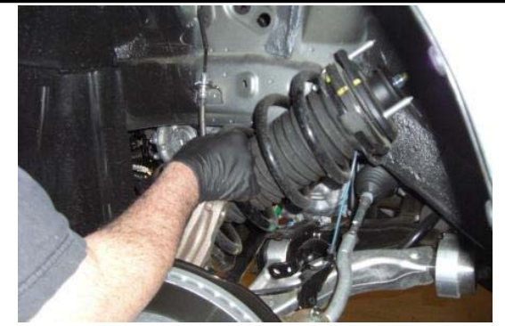
Carefully remove the strut from the vehicle making sure not to drop it on the outer CV boot. Tilting the knuckle towards the rear of the vehicle will make removal easier.