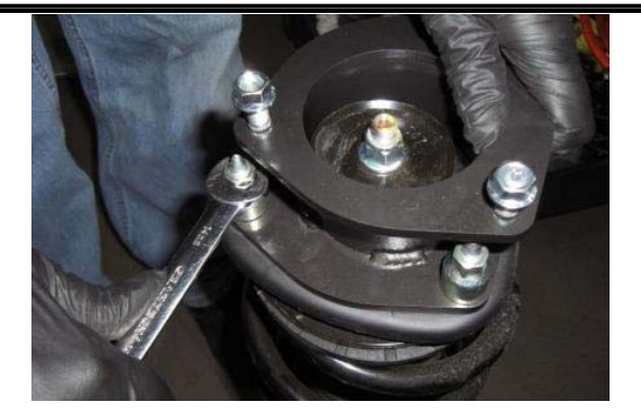
Install the Readylift strut extension using the OEM hardware. Tighten to nuts to 30 lb-ft.