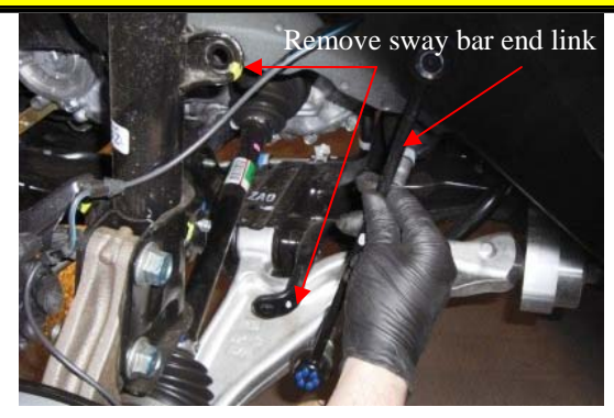
Unbolt and remove the front sway bar end link. You will not reuse this part.

Please read instructions thoroughly and completely before beginning installation. Check www.Readylift.com for any installation instruction updates Installation by a trained mechanic is recommended.