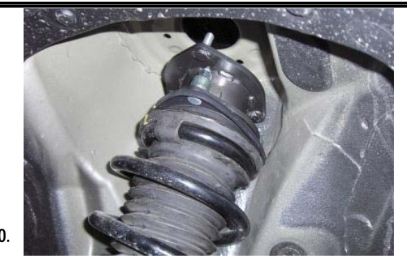
Install strut back into factory location, install nuts supplied with kit but leave loose.