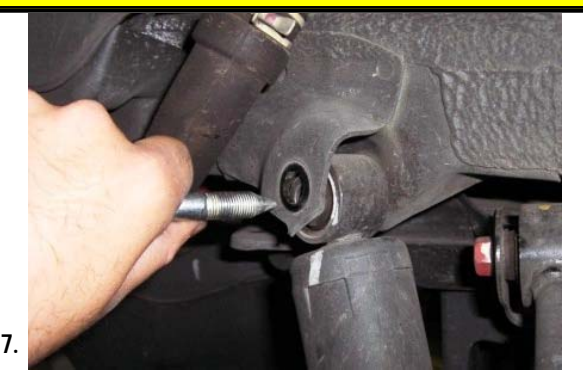
Support the lower control arm with a jack. Remove the rear upper shock mounting bolt.

Please read instructions thoroughly and completely before beginning installation. Check www.Readylift.com for any installation instruction updates Installation by a trained mechanic is recommended.