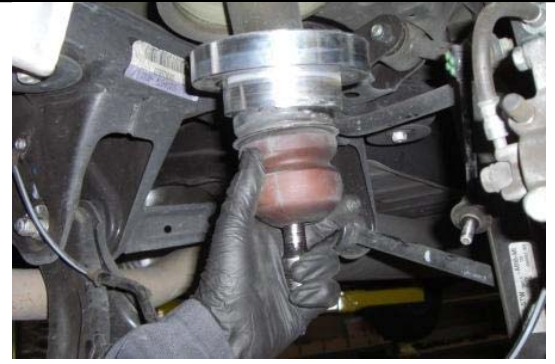
Reinstall the bump stop and bracket with the Readylift coil spacer on top.