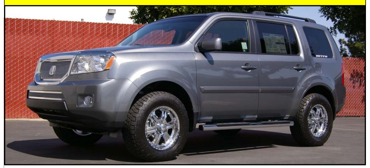
After ReadyLift® 69-8020 SST Lift kit. 265/65R17 Nitto Terra Grapplers on 17x8.5 +30 offset AR Fuel. Minor trimming needed.

Wheel Alignment; a Certified Alignment Technician that is experienced with lifted vehicles is recommended to perform the alignment. Alignment is required on both front and rear. Use factory specifications *It is recommended that you have your vehicle's alignment checked whenever installing suspension parts. *It is also recommended that you adjust your headlights whenever your vehicle's ride height is altered.