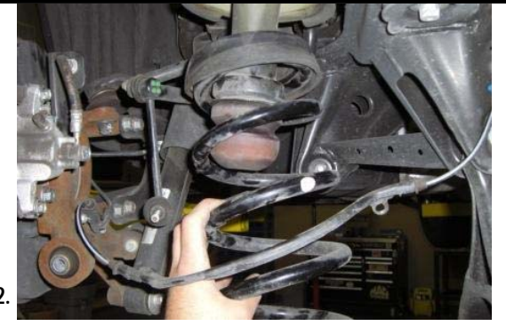
Lower the jack then remove the coil. Be sure to mark where the spring seat is on the lower control arm. You may need to loosen the cam bolt at the frame.