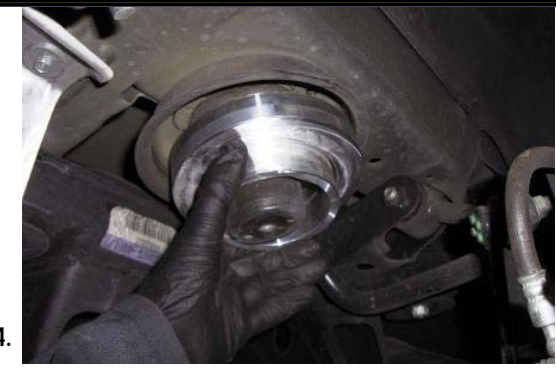
The Readylift rear coil spacer will mount in the factory coil bucket.