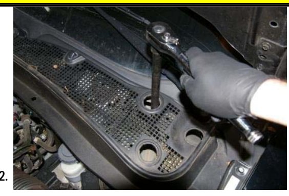
Tighten the three upper strut mounting nuts (14mm) 30 lb-ft.