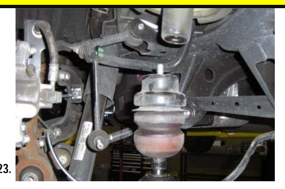
Use a 14mm socket and extension to remove the rear bump stop bracket.

Please read instructions thoroughly and completely before beginning installation. Check www.Readylift.com for any installation instruction updates Installation by a trained mechanic is recommended.