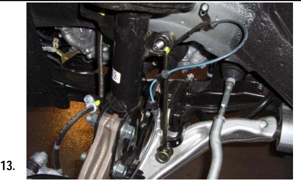
Install the supplied sway bar end link. Tighten to 85 lbft. Reinstall the brake line support bracket and ABS line support bracket using the OEM hardware.

Repeat Steps 1-13 on opposite side. Be sure to double check that all fasteners are to factory torque specifications. Reinstall the front wheels and tighten lug nuts to factory specifications. If vehicle is on a two post lift continue to the next step. REAR INSTALLATION