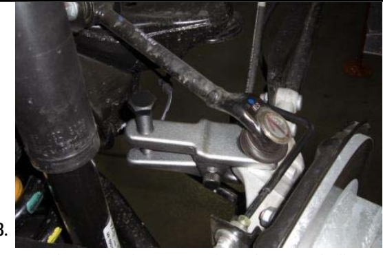
Remove the nut and cotter pin from the outer ball joint end of the upper arm and break the taper using a tie rod end separator.