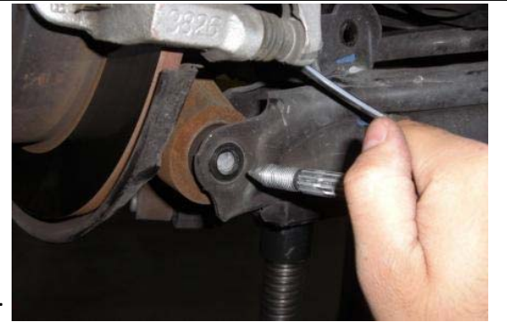
Use a jack to raise the lower control arm, align the mounting holes and install the OEM bolt. Tighten to 117 lb-ft.