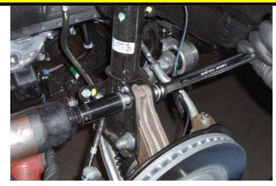
A 24mm wrench and socket will be needed to remove the lower strut mounting bolts.