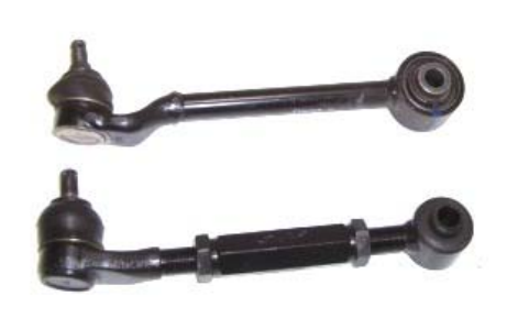
Adjust the EZ Arm to the same length as the stock arm. Install the arm by first installing the bolt at the body, but DO NOT TIGHTEN. Install the ball joint end into the knuckle using the OEM nut and cotter pin.