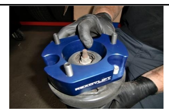
Place assembled strut extender on top of OE coil-over assembly with factory hardware.

Use allen wrench or proper tool to tighten set screw studs.