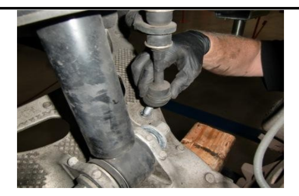
Once both sides are complete reattach sway bar endlinks simultaneously and tighten to factory specs.

Tighten ball joint nut to factory specs. Complete these steps on opposite side of vehicle.