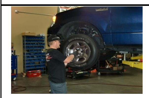
Check all work, reinstall wheels/tires and lower vehicle to ground. Torque wheels, get alignment and enjoy!