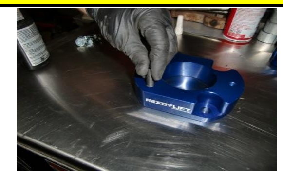
Begin assembling your T6-2058 billet aluminum extended strut extension by applying thread locking compound and installing supplied set screws.

Please read instructions thoroughly and completely before beginning installation. Check www.Readylift.com for any installation instruction updates Installation by a trained mechanic is recommended.